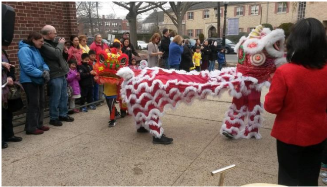
Dragon Dance as part of Lunar New Year Event

The biggest event of 2016 was Lunar New Year, attended by more than 400 people. This has been one of the biggest events every year since its launch in 2014. Maker Day was also a noteworthy event, as more than 200 people attended a variety of stations put together by library staff and volunteers. The Summer Reading Program also saw healthy increases, with 334 people signing up and 2,993 books read. In 2015, by contrast, 278 people signed up and read 1,729 books. In 2014, 263 signed up and read 1,979 books.